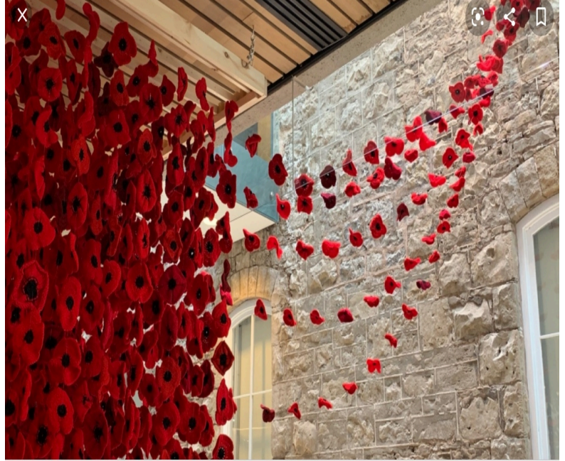
Inside the museum

Niagara Fire Department volunteered to help hang the display